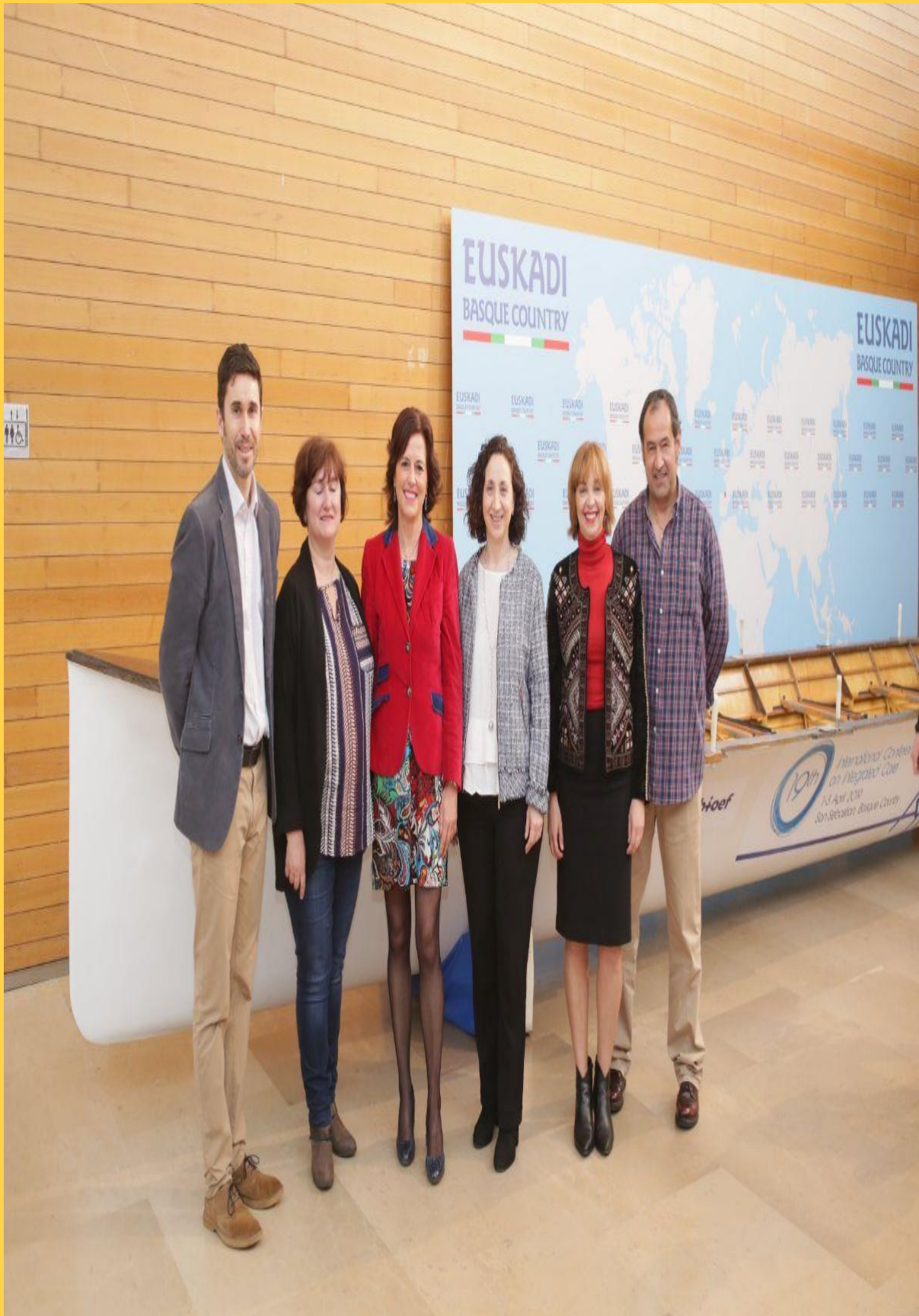
Bringing a conference to a region is no small undertaking, in particular when so many countries and disciplines are represented at one